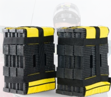
Crib Toter Kit Mfg. Part #: CT44PL-18

Keeps the Hybrid Crib® blocks organized and easier to carry. Blocks and Crib Toter bags are washable and ergonomically designed. Ideal for storage in compact spaces.