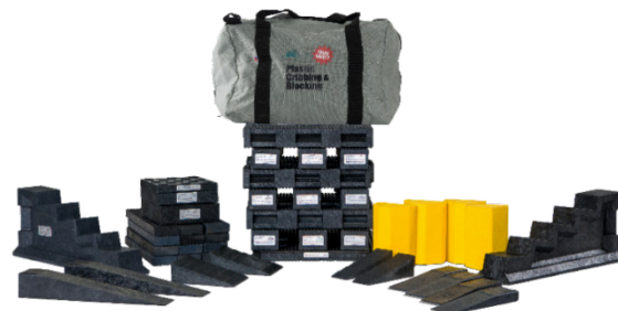
Auto X Kit B Mfg. Part #: Auto X Kit B

There are many available configurations of Dura Crib/Dura Sta brand products in kit form for first responders. The Auto X-B kit contains our most popular products. This kit is portable and rescue ready for deployment.