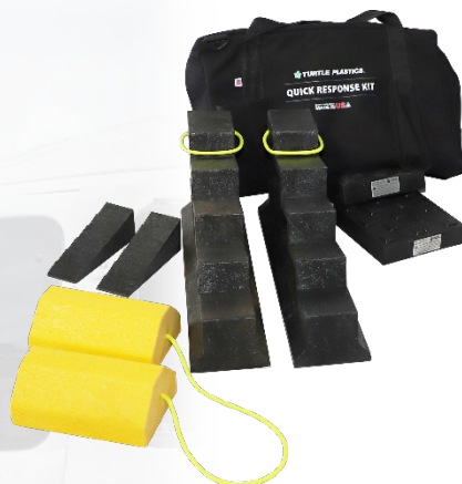
Quick Response Kit Mfg. Part #: QR-2 Kit

Working Load of Each 44PL-18 Cribbing Block = 20,500kg/45,194lbs