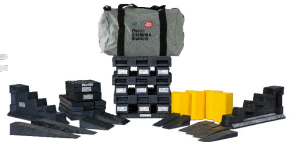
Auto X Kit B Mfg. Part #: Auto X Kit B Engine Kits

There are many available configurations of Dura Crib®/Dura Stat® brand products in kit form for first responders. The Auto X-B kit contains our most popular products. This kit is portable and rescue ready for deployment.