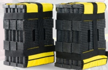
Crib Toter Kit Mfg. Part #: CT44PL-18

New for 2004 QR-2 , BASK and Auto X Carry Bags are Black