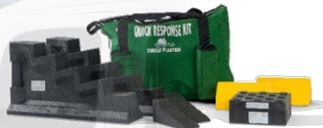
Quick Response Kit Mfg. Part #: QR-2 Kit

Working Load of Each 44PL-18 Cribbing Block = 20,500kg/45,194lbs