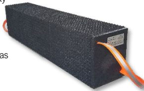
BLACK DIAMOND CRIB Mfg. Part # 67HDC-30