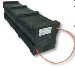
PRIME CRIB Mfg. Part # 67PC-24