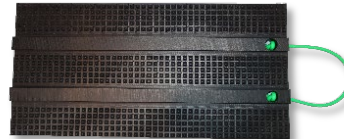
SLAB PAD Mfg. Part # SP24