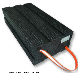
THE SLAB Mfg. Part # S612-24