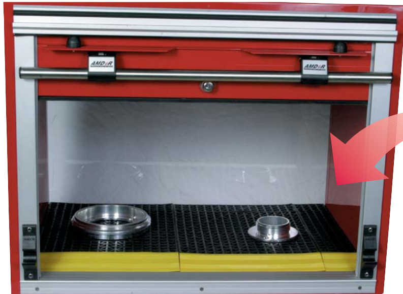
Ramps are optional.